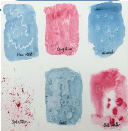
Different ways of creating texture with water colour paints